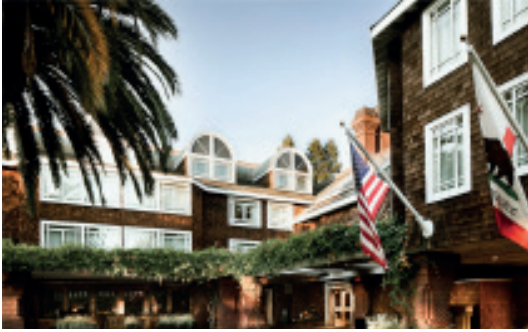
"SemaConnect's open network has made the hotel's EV charging stations accessible to more than 1 million EV drivers in the U.S."